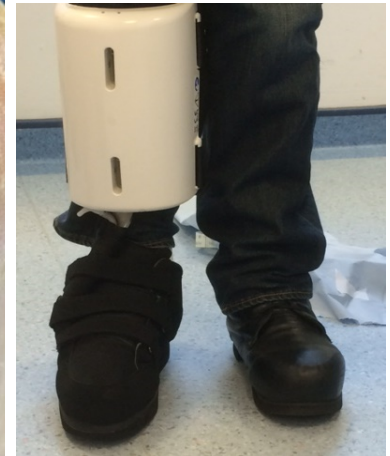
PulseFlowDF/ Contralateral custom shoe

Non-diabetic neuropath. Numerous footwear and TCC tried. DVT with TCC. Further Amputation considered. PulseFlowDF prescribed